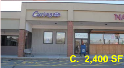
C. 2,400 SF