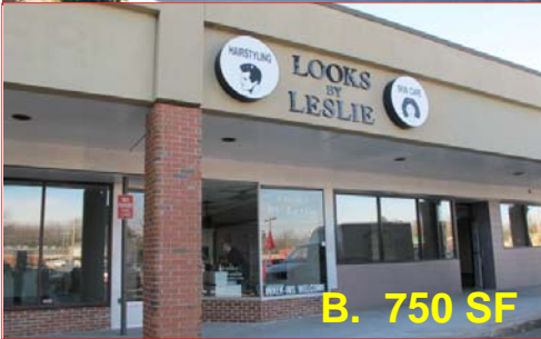
B. 750 SF