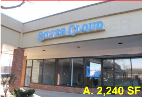
A. 2,240 SF